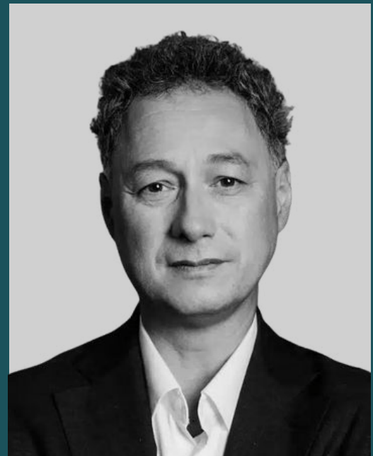
ALAIN CAMONIER PALLAS LAWYERS & MEDIATORS