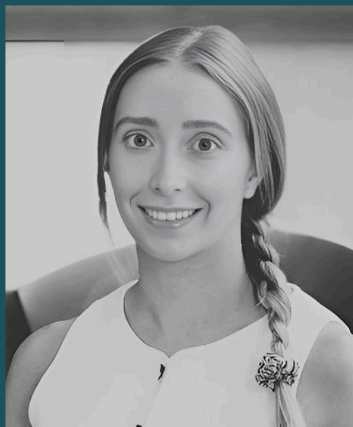
ABBIE HEAD BIRKETTS LLP